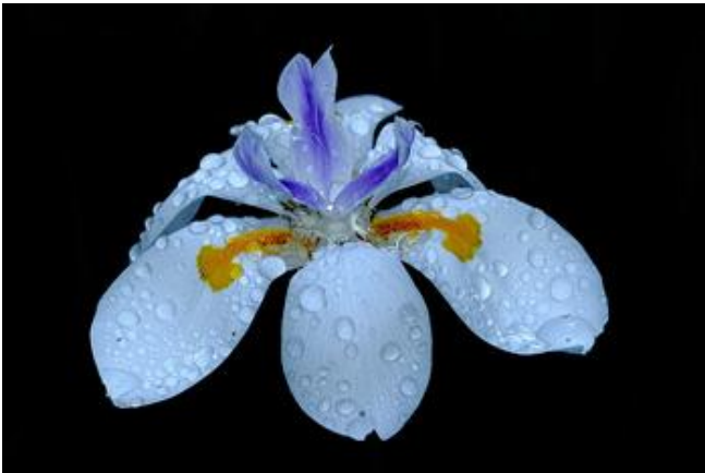
Raindrops – Nature