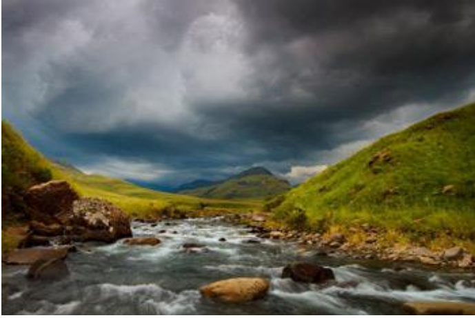
Lotheni River – Scapes