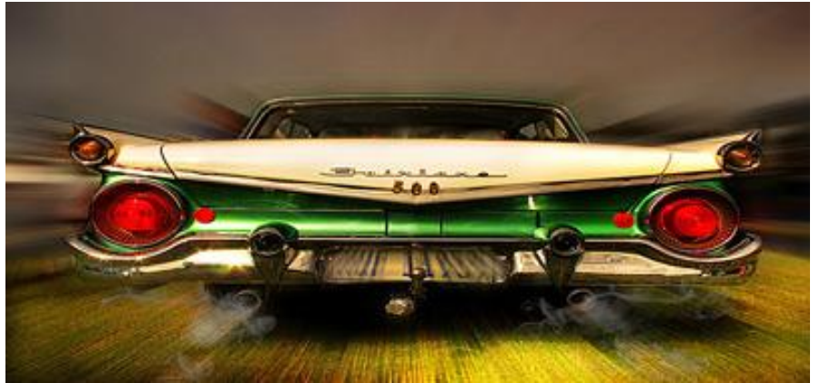
Fairlane - Altered Reality