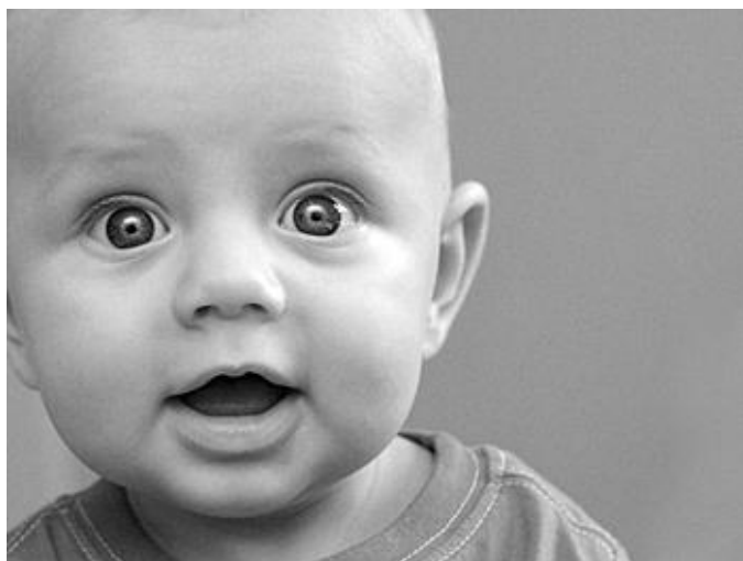
Hello There – Monochrome