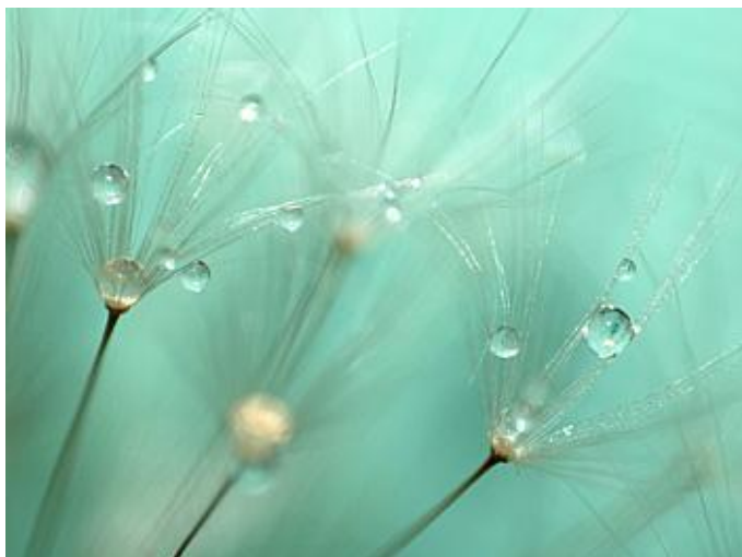
Dewy Dandelion – Nature