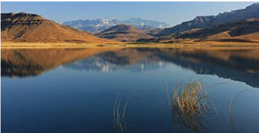
Splendour - Scapes