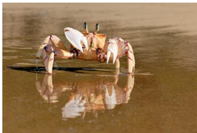
Aggressive Crab – Nature