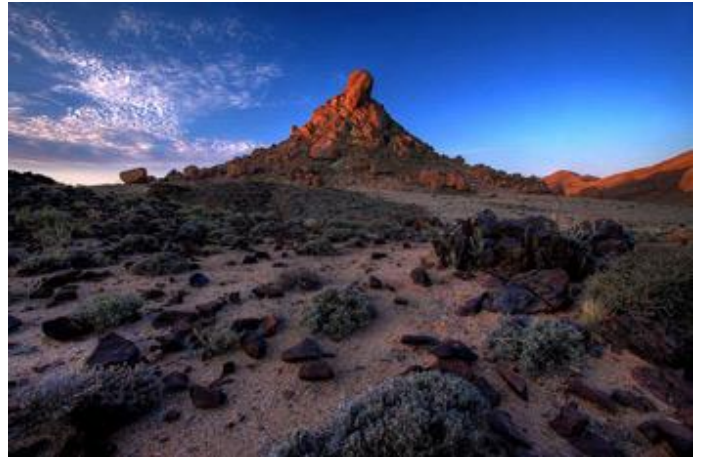
Kokerboomkloof – Scapes