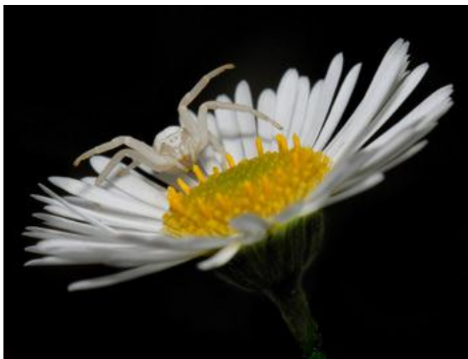
White Crab Spider – Nature