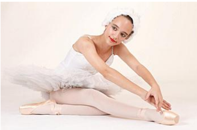
Ballerina 4 – Pictorial