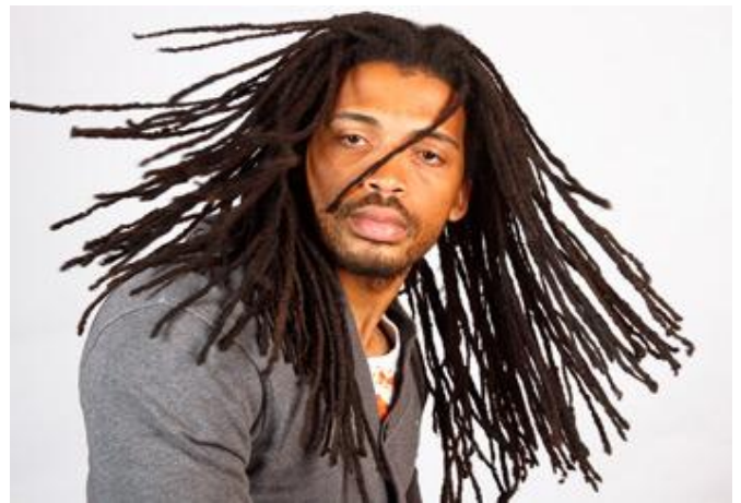
Rasta 2 – Pictorial