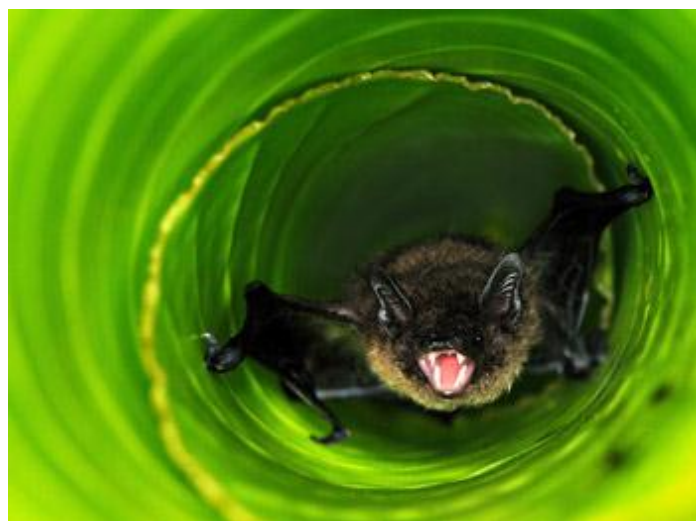
Angry Banana Bat – Pictorial