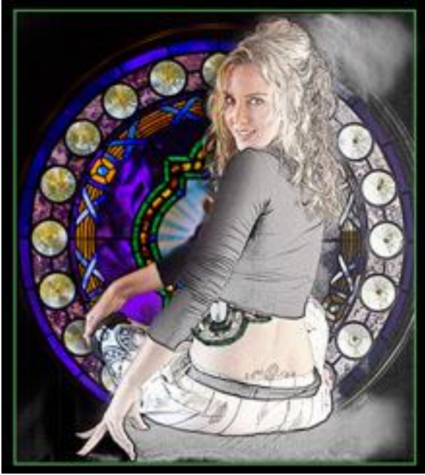
The Body is a Temple – Altered Reality