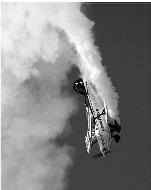
Smoking Pitt – Monochrome