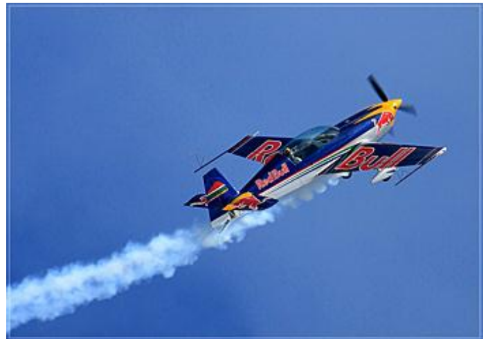
Redbull Gives U Wings – Sport