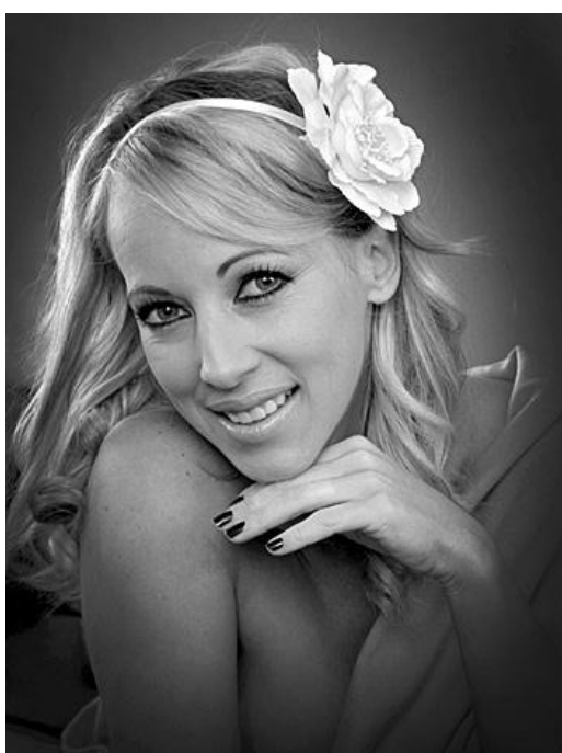
Candy – Monochrome