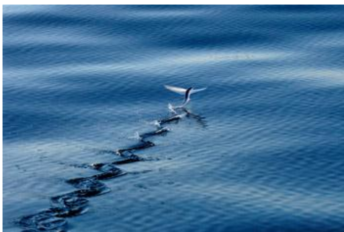
Flying Fish – Nature – COM