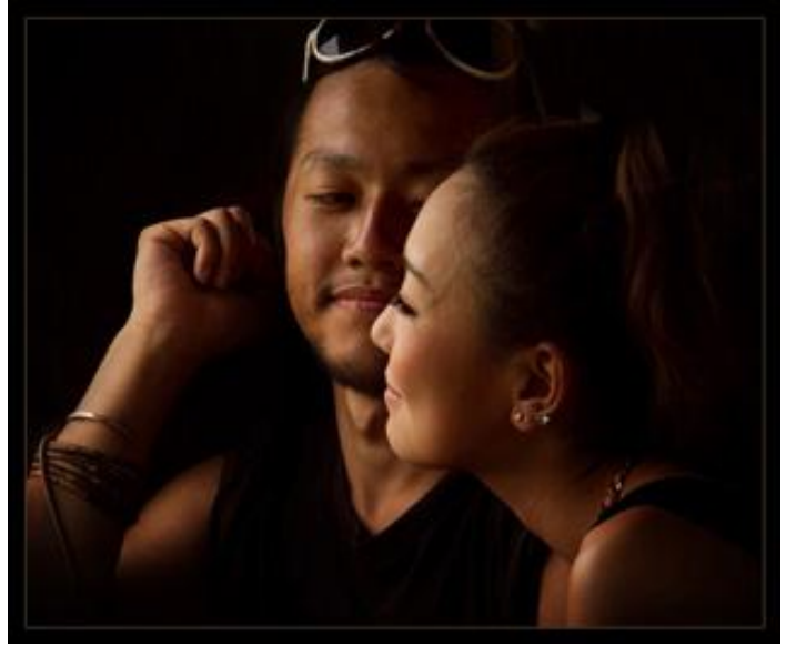
Adoration – Pictorial