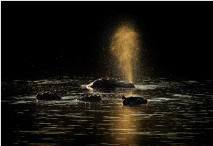
Morning Glory – Nature