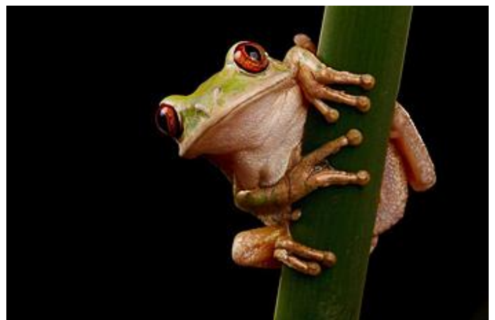
Forest Tree Frog Portrait – Pictorial