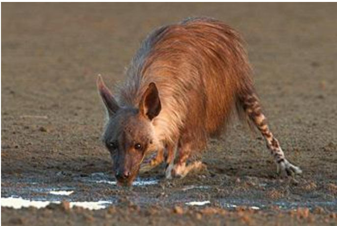
Strandwolf Drink – Nature