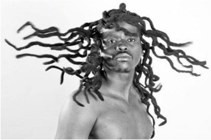
Thanda 2 – Monochrome