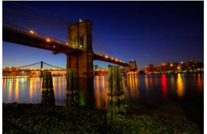
Brooklyn Bridge – Scapes