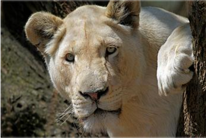
Watching You – Nature