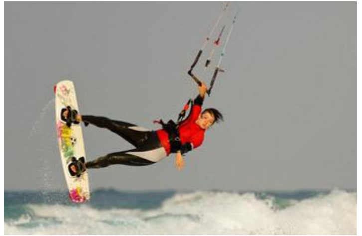
Polish Girl Remade – Sport