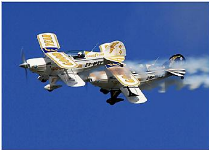
Smokinng – Sport