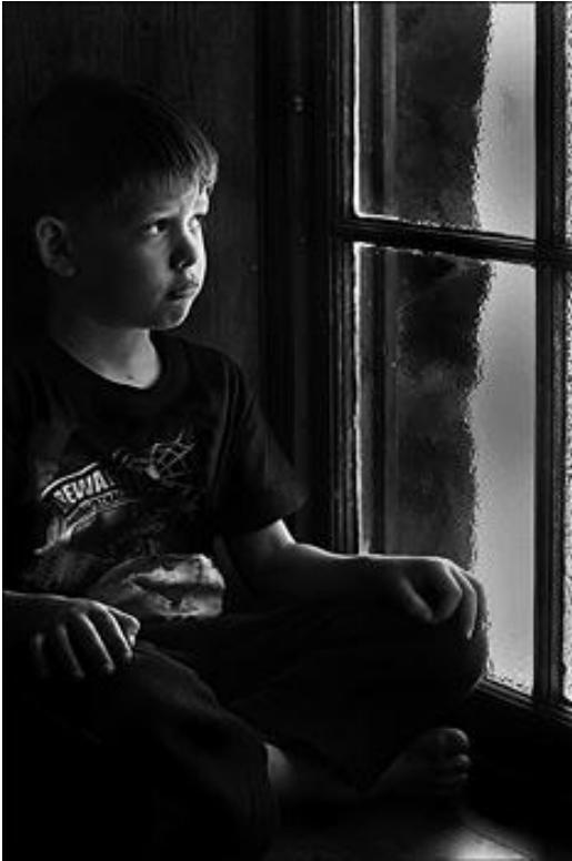
Boy in Window – Monochrome