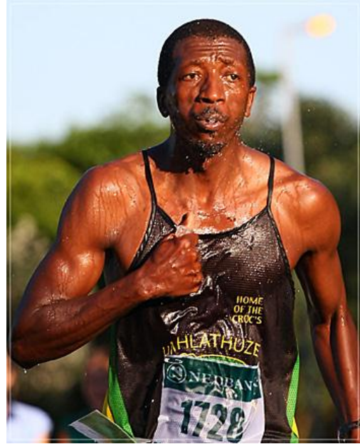
Thirsty Runner – Sport